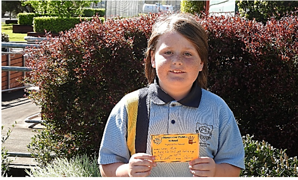
3/4H: Urban Holden