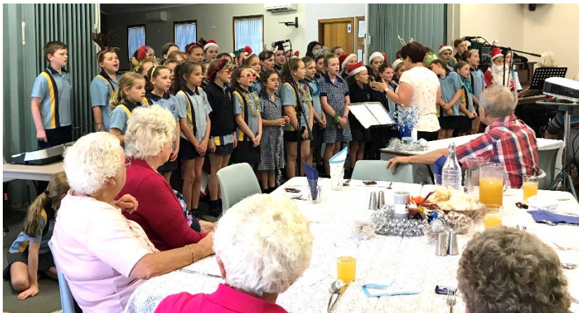
The choir performing at the Baptist Seniors' lunch (left) and Hillcrest Nursing Home (below)