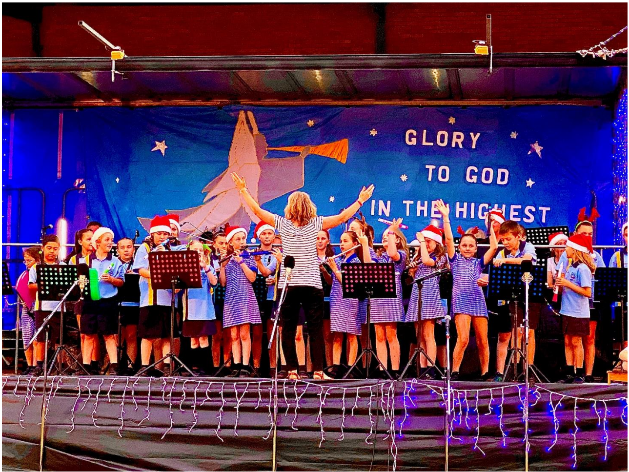
The Windstars performing at Carols by Candlelight last Sunday night